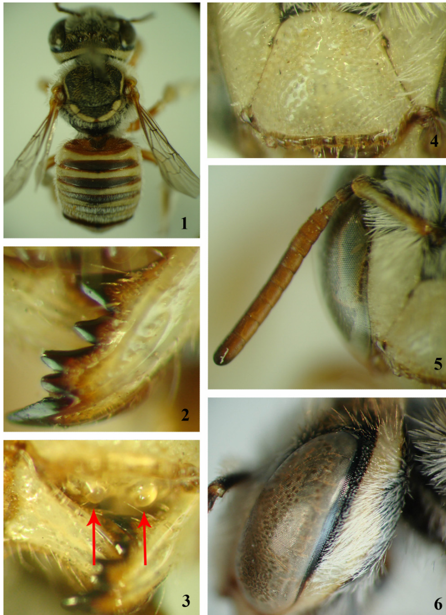
Figures 1-6. Anthidium (A.) akanthurum sp. nov. (female). 1- dorsal view; 2- details of mandible; 3- details of base of labrum; 4- clypeus; 5- antenna; 6- head in lateral view.

Korea, North Africa (Warncke 1980, Banaszak & Romasenko 1998, Stöckl 2000, Amiet et al. 2004, Proshchalykin 2007, Ornos et al. 2008, Grace 2010).