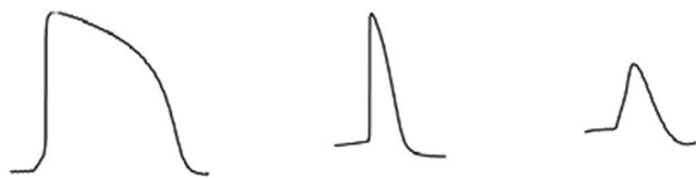
FIGURE A1 Three general types of action potential for human cardiomyocytes