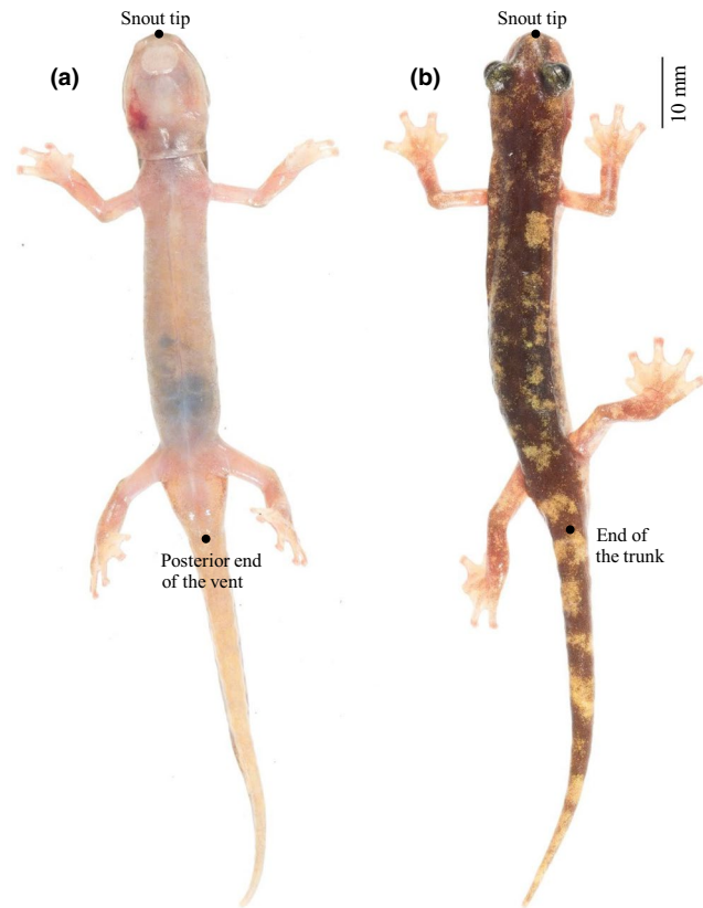
FIGURE 1 Hydromantes flavus (individual 1074777; Lunghi et al., 2020). (a) Ventral view, the points to measure SVL are marked. (b) Dorsal view, the points to measure SVL e are marked

The European Hydromantes are comprised of eight threatened species distributed in Italy and France (Lanza et al., 2006). These salamanders are strictly protected by national and international laws (European Community, 1992; Rondinini, Battistoni, Peronace, & Teofili, 2013) because multiple threats, such as habitat degradation, climate change, spread of pathogens, and poaching, are negatively impacting their populations (Lunghi, Corti, Manenti, & Ficetola, 2019; Mammola et al., 2019; Martel et al., 2014); therefore, specific authorizations are needed to conduct studies on these