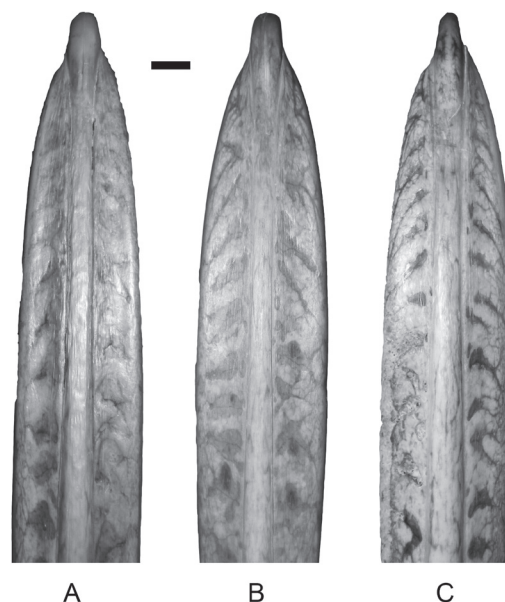
Figure 1. Dorsal view of the rostral end of the bill of the Spot-billed Pelican ( Pelecanus philippensis ), illustrating the presence of spots. Specimens are from the research collections of the Institute of Zoology (IOZ) of the Chinese Academy of Sciences in Beijing (A. IOZ 21030; B. IOZ 21033; C. IOZ 44412; Scale bar = 1 cm).

Four specimens with locality and collection information out of the 11 pelican skins and mounted specimens in the IOZ can be verified to be of Spot-Billed Pelicans. An additional two specimens appear to have spotted bills, but their locality information appears erroneous or at least questionable. Specimen IOZ 44412 is an individual collected 20 September 1963 in Meihua, Fujian Province (Fig. 2). The original specimen label identifies the individual as a juvenile female of " Pelecanus r. roseus ," and she may be the specimen from Fujian Province reported by BirdLife International (2001, p. 102). It is likely that this individual is the historically latest known specimen of this species from China. Specimens IOZ 21032 and 21033 are two unsexed study skins collected in 1897 (no calendar date known) from Fuzhou in Fujian Province (Fig. 2). Both specimens are labeled separately as " P. r. roseus " and " P. philippensis " originally from "E. Mus. Huede" and donated by Mr. de la