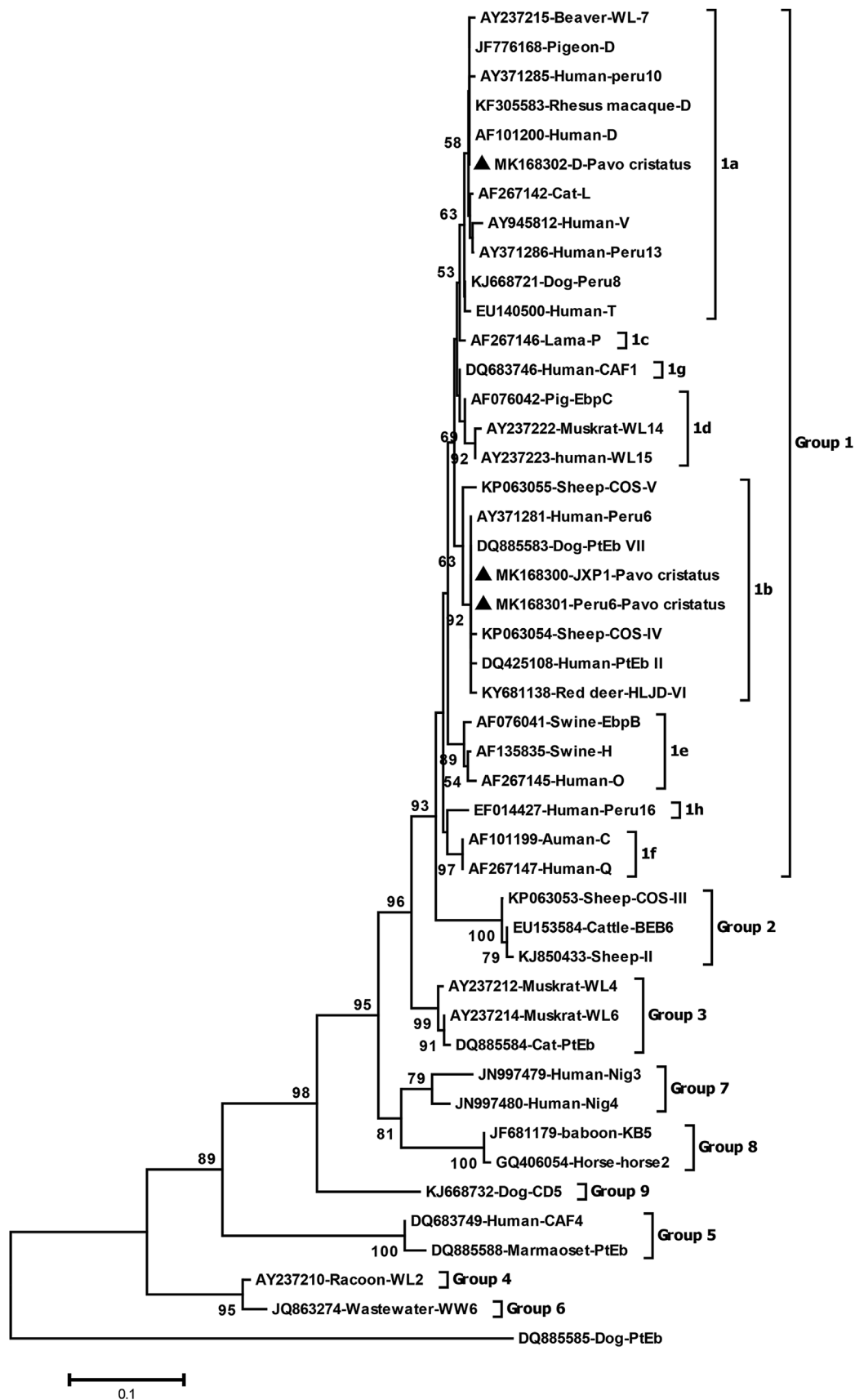
Fig. 1. Phylogenetic relationships of ITS nucleotide sequences of Enterocytozoon bieneusi identified in the present study and reference genotypes. The phylogenetic tree was constructed with a Neighbor-Joining method with the Kimura 2-parameter model. Bootstrap values > 50% from 1000 replicates are shown on the nodes. The E. bieneusi genotype PtEb (DQ885585) from dog was used as outgroup. The genotypes detected in the current study are shown with solid triangle.